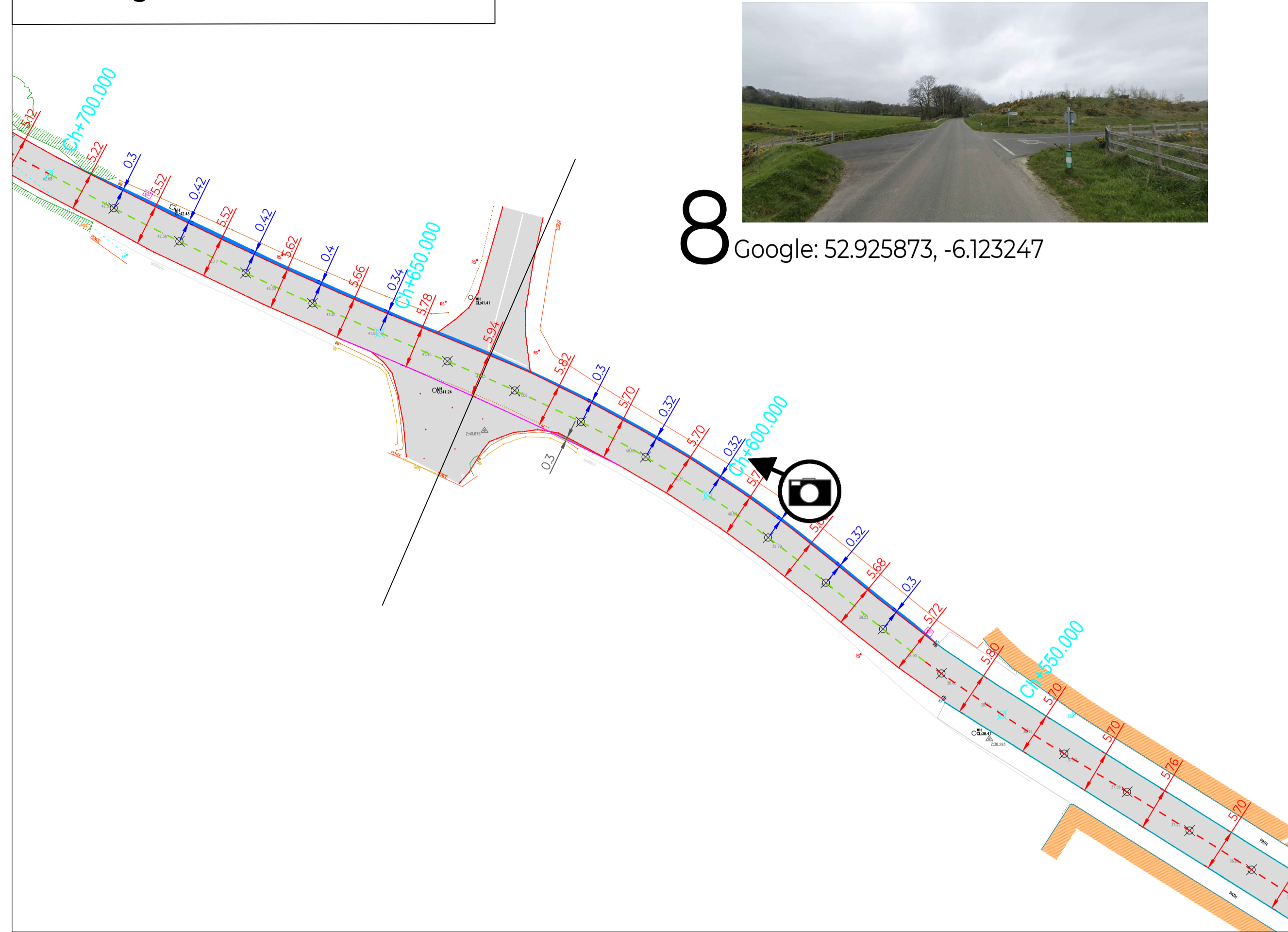
8 Google: 52.925873, -6.123247