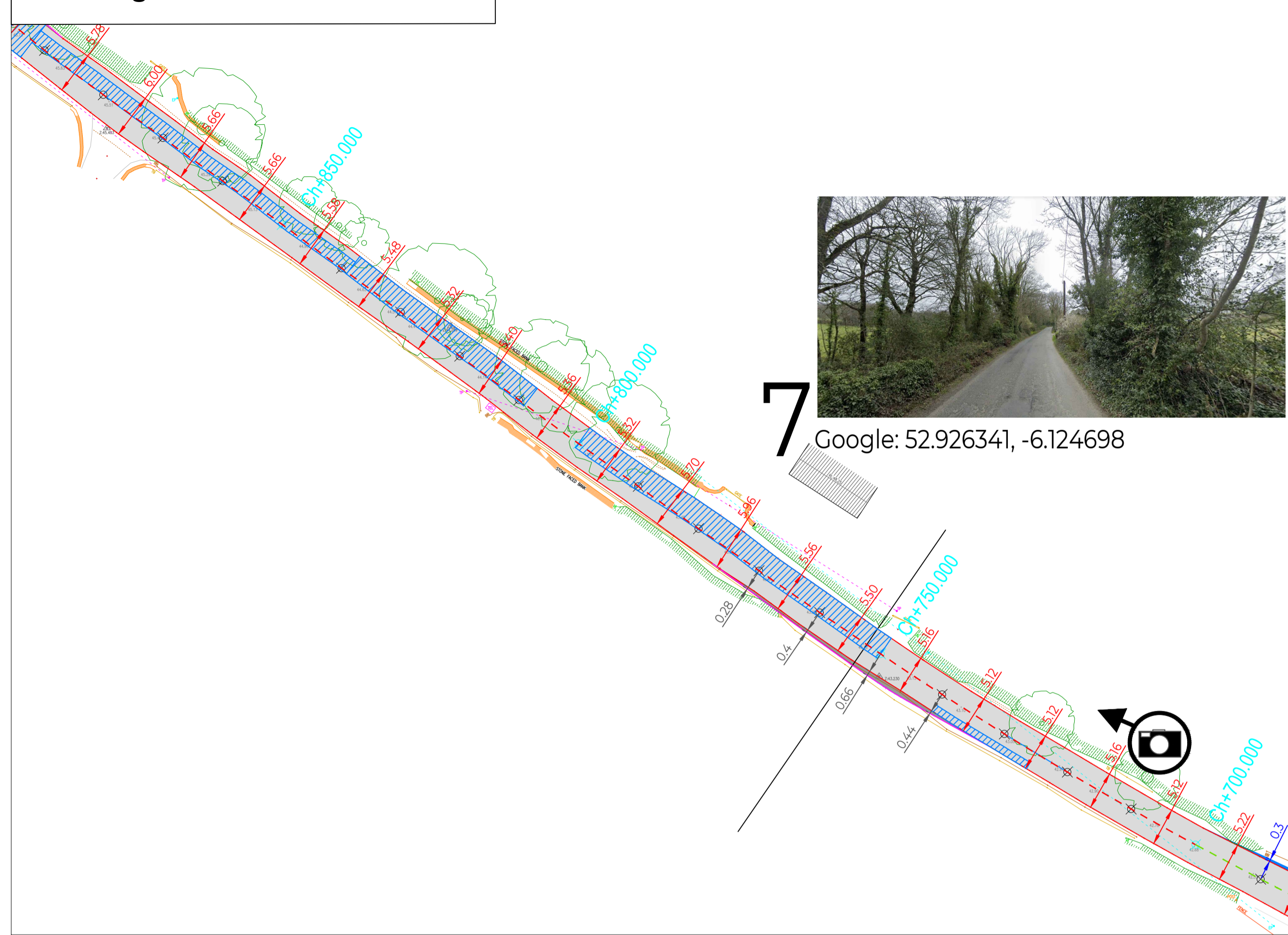
7 Google: 52.926341, -6.124698