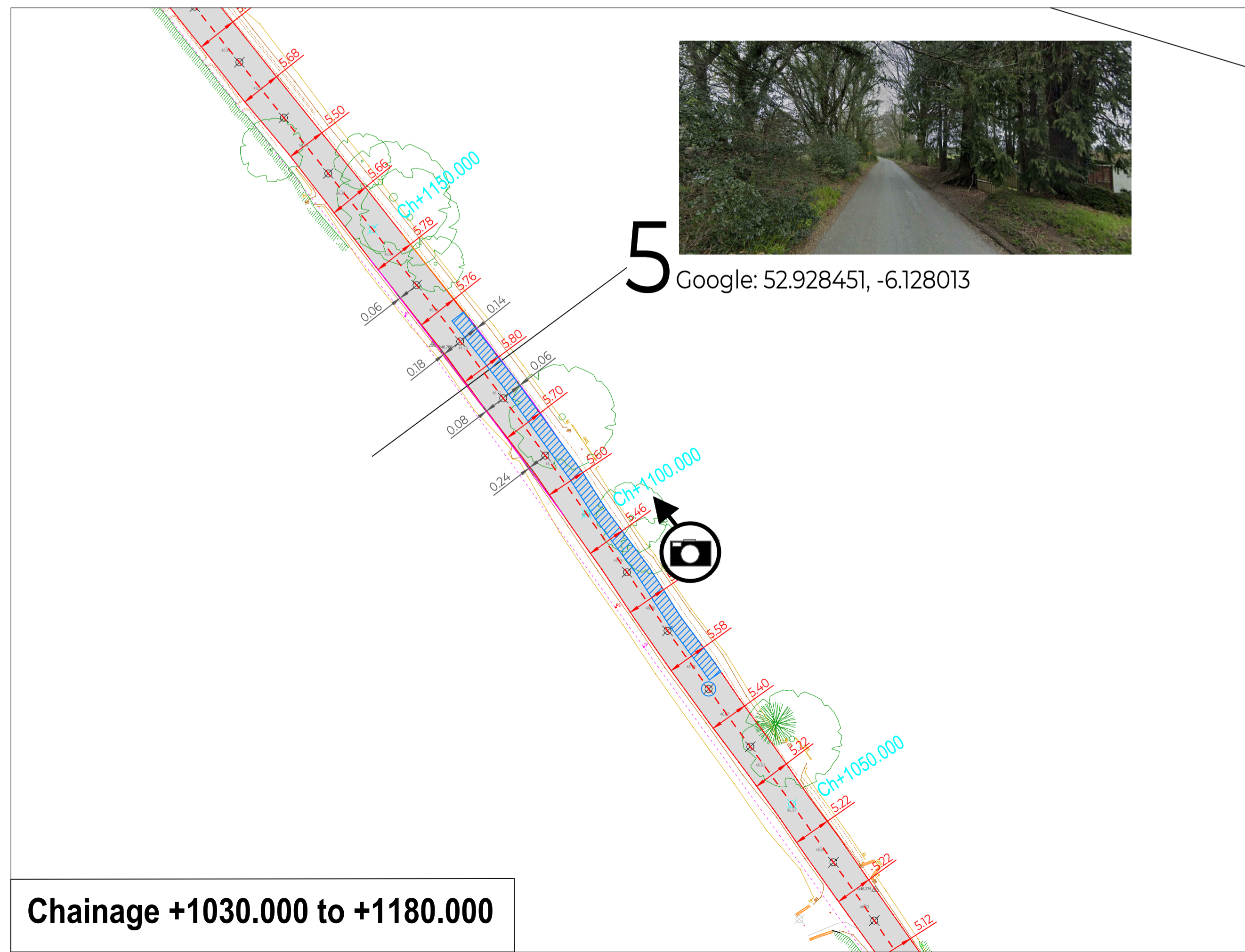
5 Google: 52.928451, -6.128013