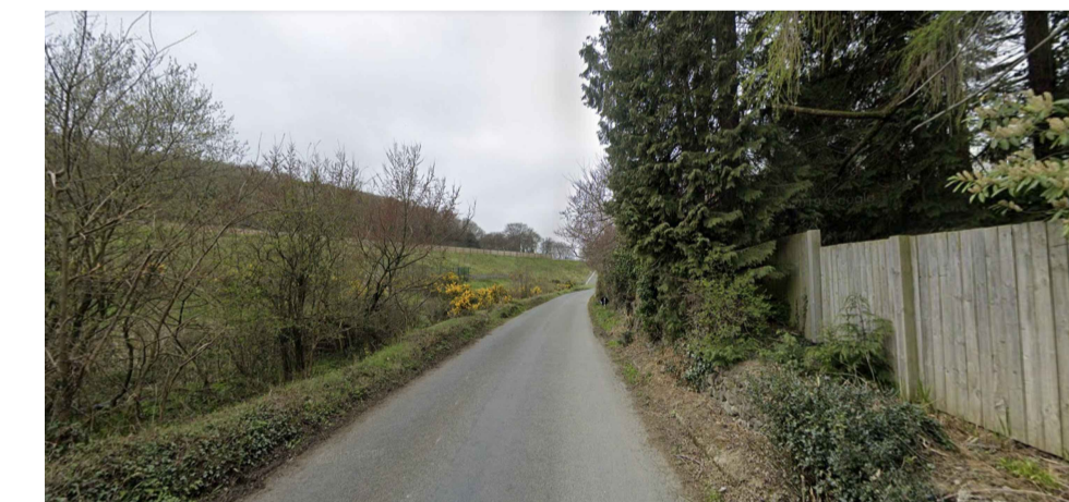
10 Google: 52.924301, -6.118987