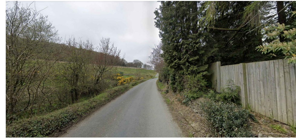
10 Google: 52.924301, -6.118987