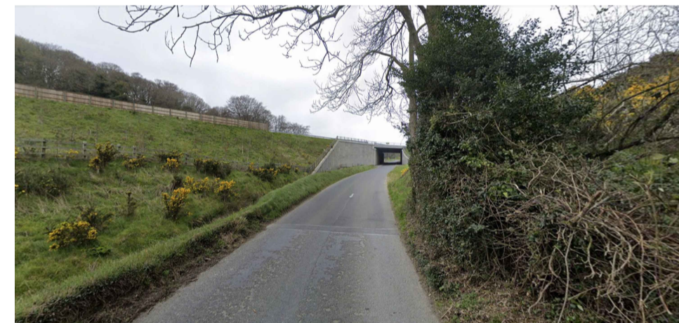
9 Google: 52.924617, -6.120222