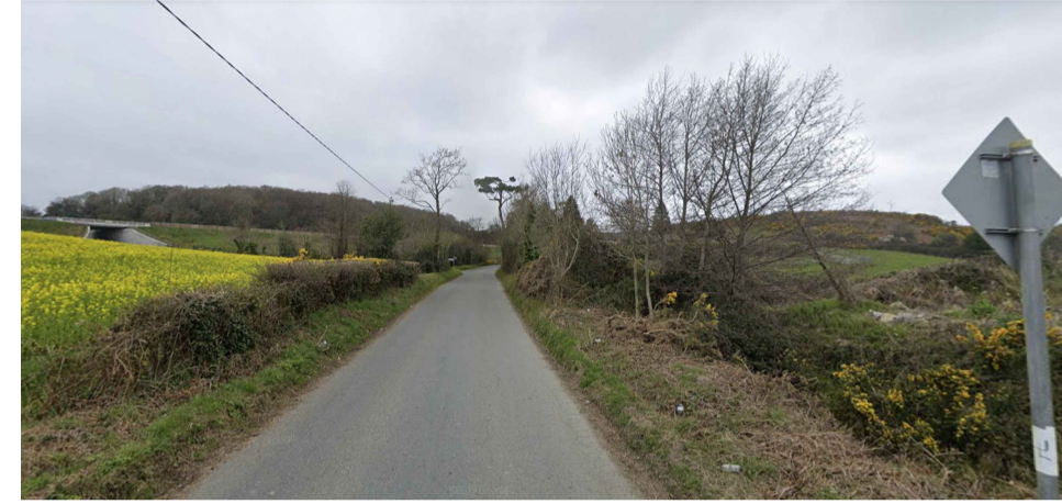
11 Google: 52.924089, -6.117048